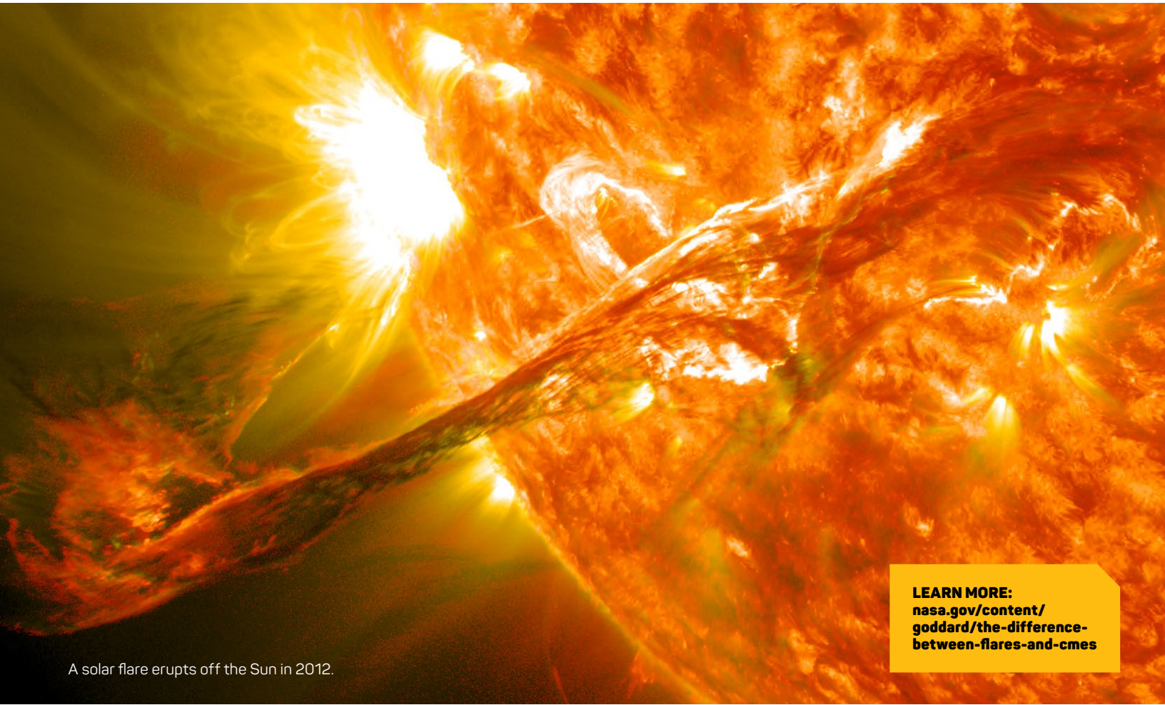
A solar flare erupts off the Sun in 2012.

LEARN MORE: nasa.gov/content/goddard/the-difference-between-flares-and-cmes